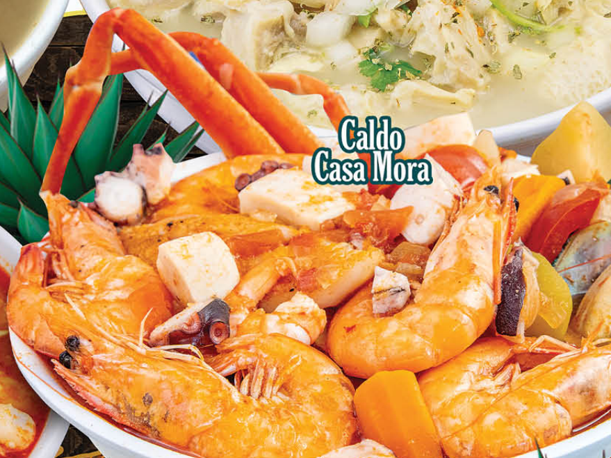
Caldo Casa Mora

*WARNING: Consuming raw or undercooked meats, poultry, seafood, shellfish or eggs may increase your risk of food borne illness *AVISO IMPORTANTE: El consumo de carnes, aves, mariscos, huevos crudos o poco cocidos puede aumentar el riesgo de contraer enfermedades transmitidas por los alimentos