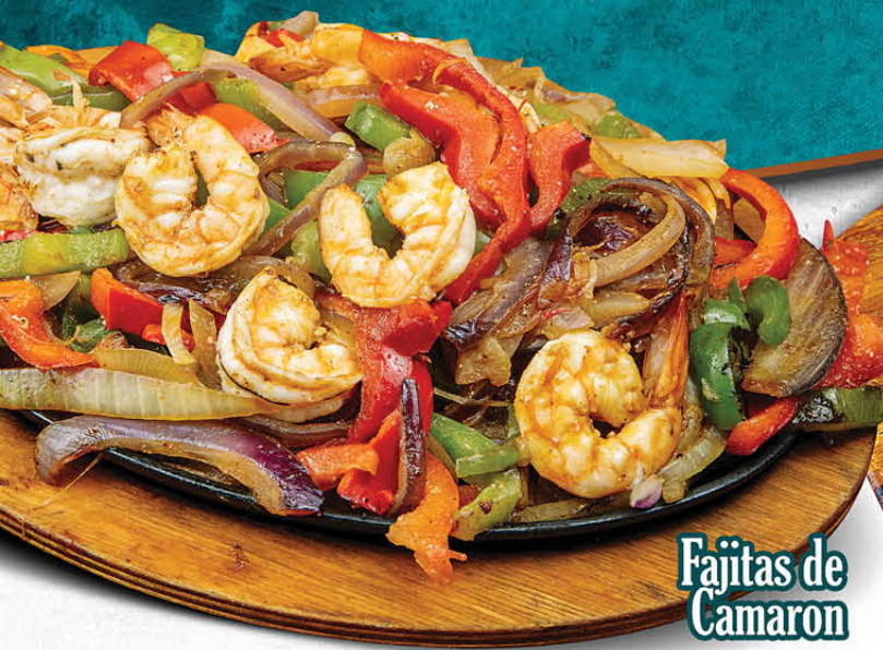
Fajitas de Camaron