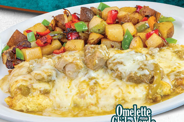
Omelette Chile Verde