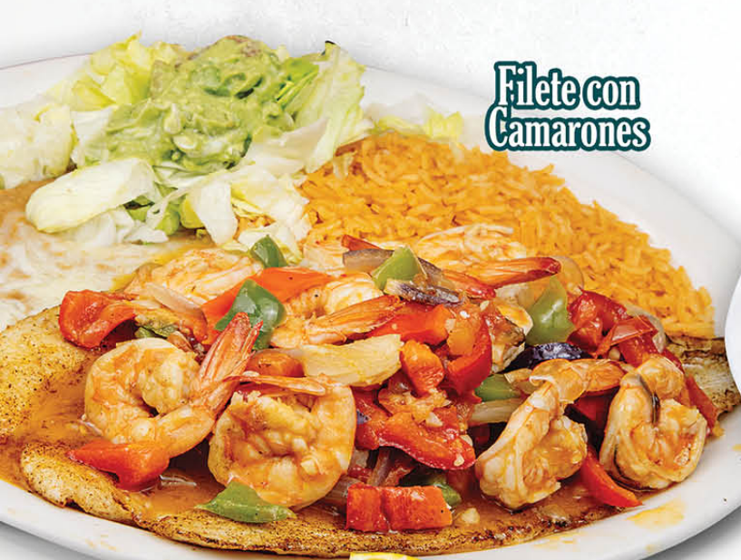
Filete con Camarones