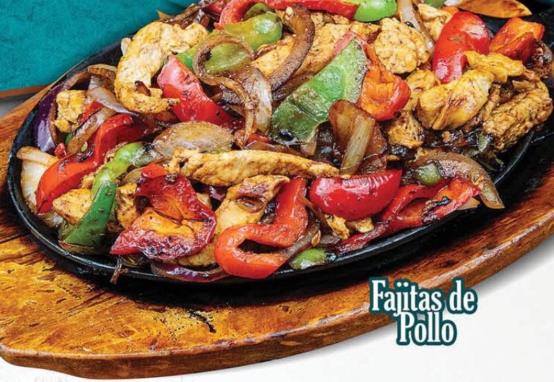
Fajitas de Pollo