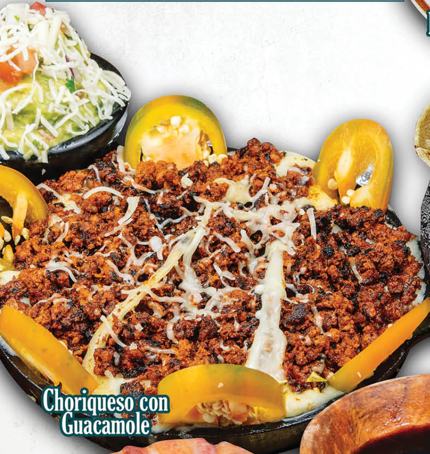
Choriqueso con Guacamole