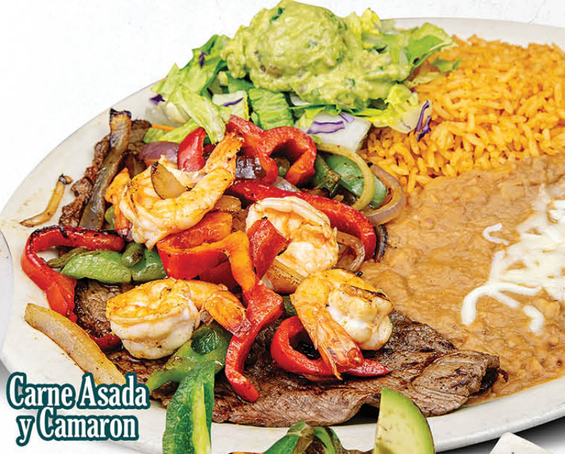
Carne Asada y Camaron