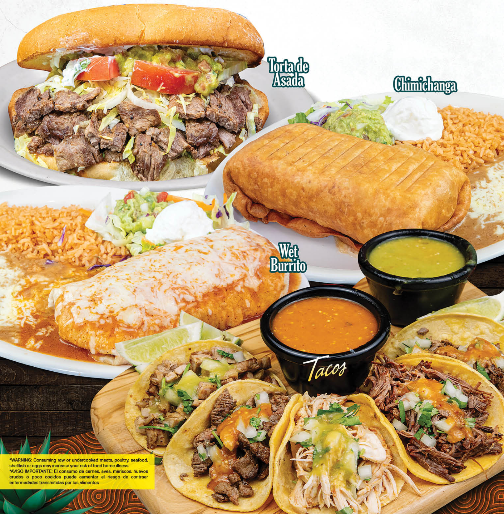
Torta de Asada

Hazlo chimichanga por 1.99 Make it chimichanga for 1.99