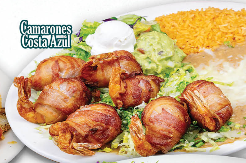
Camarones Costa Azul