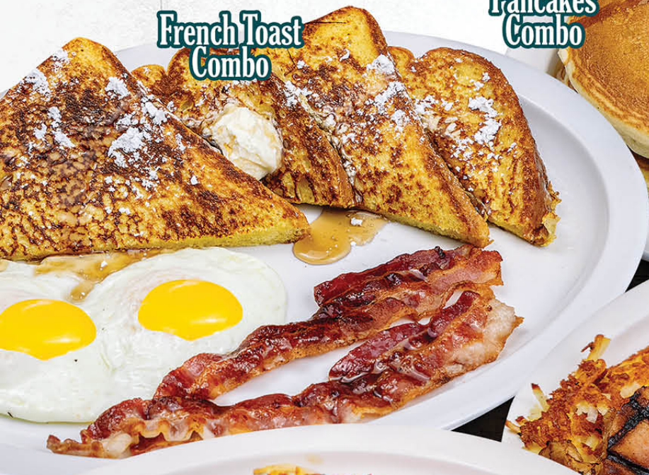
French Toast Combo