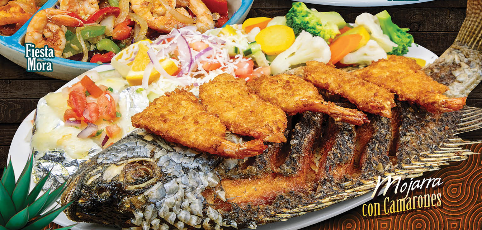
Mojarra con Camarones