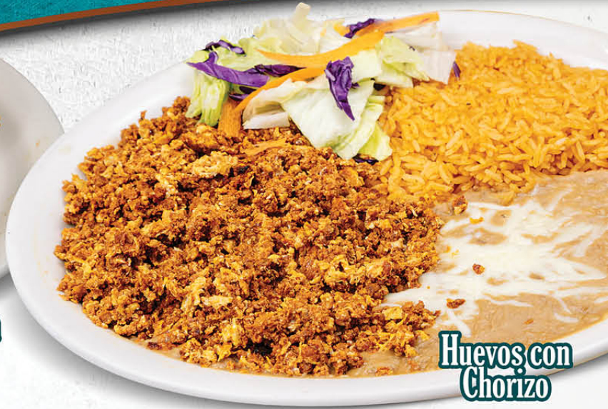
Huevos con Chorizo