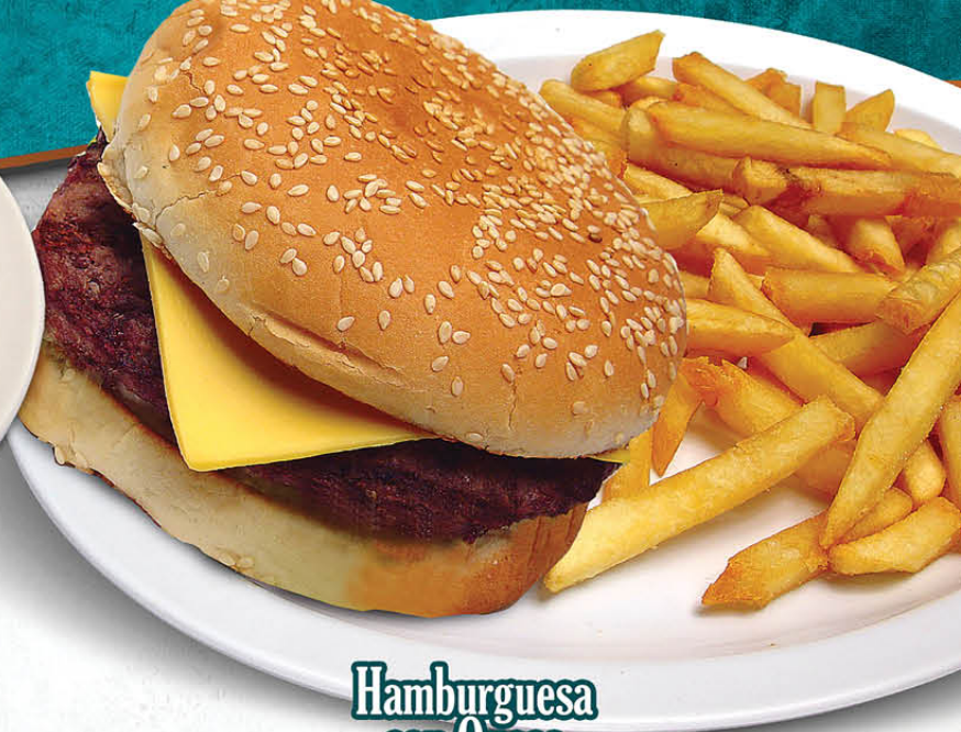
Hamburguesa con Queso